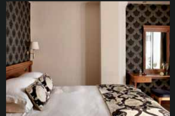
AVA Exclusive Suite